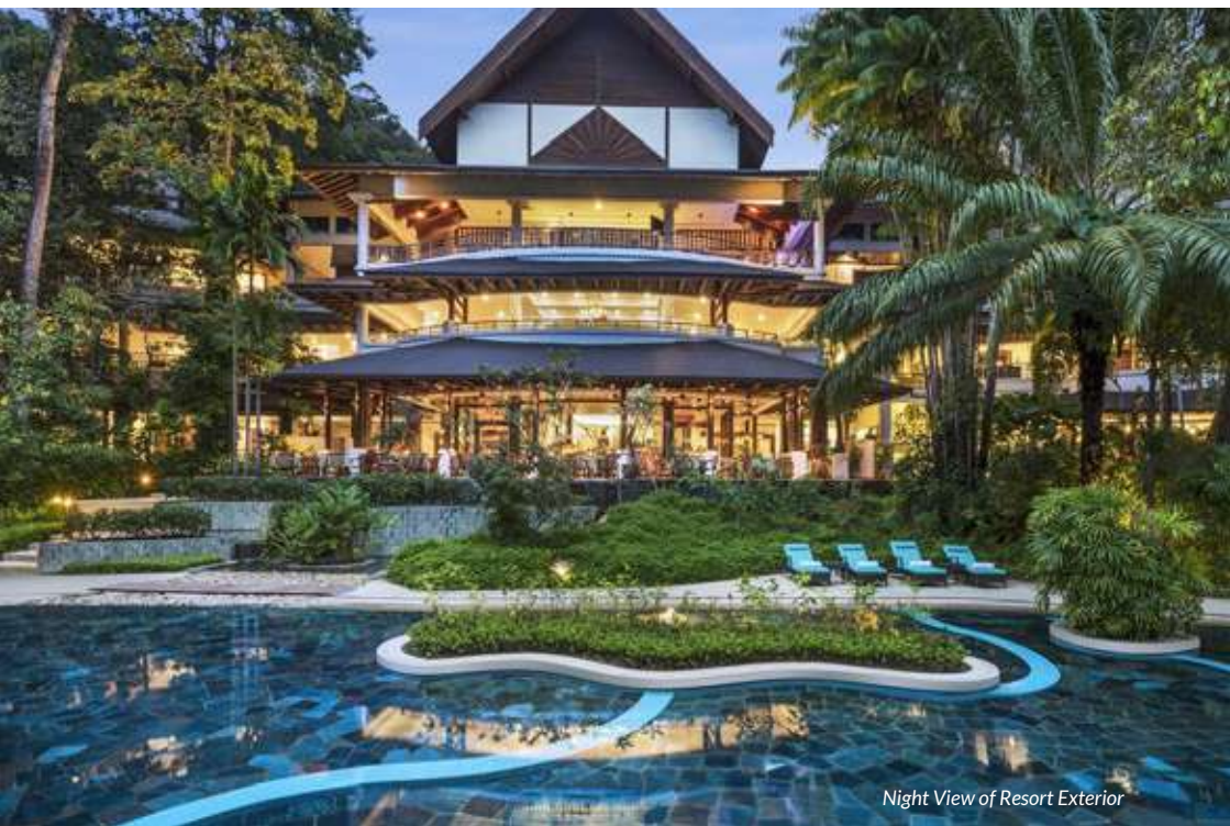
Night View of Resort Exterior