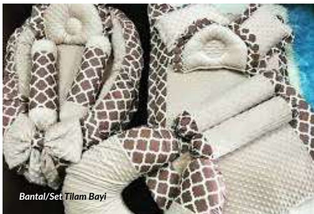
Bantal/Set Tilam Bayi