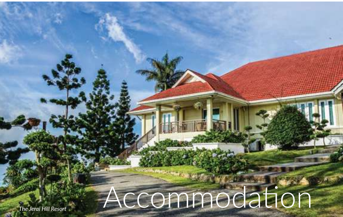
The Jerai Hill Resort