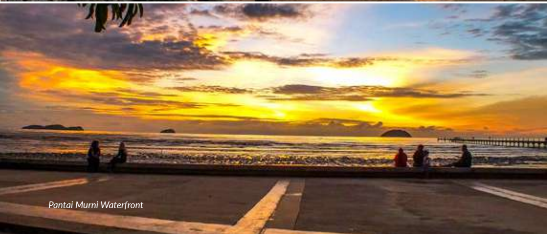
Pantai Murni Waterfront